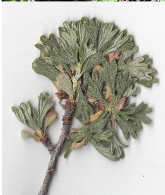
Figure 1. Purshia tridentata var. tridentata from southern Idaho.