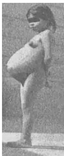
Figure 1. A female Minor victim of rape (she was raped shortly after her first period and she became pregnant. Will I say nature is cruel?

The consideration in the past on the cause of rape was the unbridled sexual desire, but recent understanding put it as a pathological assertion of power over the victim. Rape has been reported virtually everywhere in the world [5]. Virtually all societies have had the dehumanizing impact of it. Rape has not featured strongly as a policy priority in the Nigerian system for the last two decades and, in many ways, has been engulfed by strong national and international attention on domestic violence, banditry, kidnapping, and terrorism. Rape, sexual violence, is a heinous and notorious crime [6]. Physically unattractive persons who have been victims of rape may question the saying that rape is physically impossible in certain groups (Fig. 1). It is forced, unwanted, and upsetting. Researchers theorized that rape is a respecter of nobody. It must not be neglected in any way and at any time.